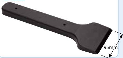
SD6123 NYLON BOLSTER HEAD CHISEL