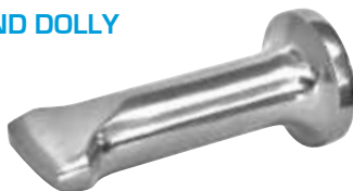
HD1027 ROUND & PEIN END DOLLY