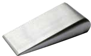
HD1066 WEDGE DOLLY