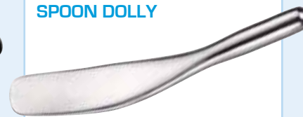
SD1033 FLAT WIDE SPOON DOLLY