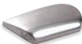
HD2547 ANGLE DOLLY