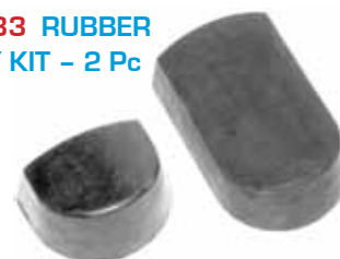
SD5033 RUBBER DOLLY KIT - 2 Pc