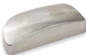
HD2558 THICK TOE DOLLY