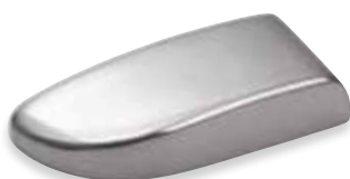
HD2548 THIN TOE DOLLY