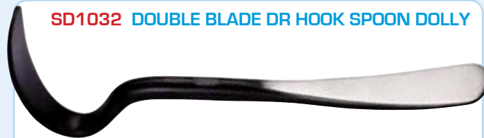
SD1032 DOUBLE BLADE DR HOOK SPOON DOLLY