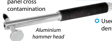
Aluminium hammer head