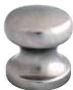
HD1028 DOUBLE END ROUND DOLLY