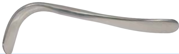
SD1031 DOUBLE BLADE L HOOK SPOON DOLLY