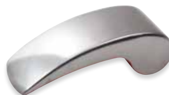
HD2553 CURVED DOLLY