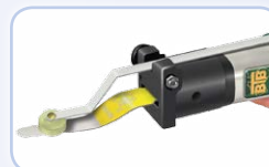
Cutting depth control