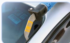
Blades for all applications