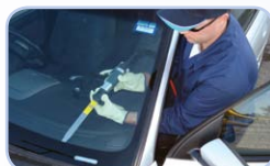
Reach below dashboards

See Page 6 for Auto Glass Removal Applications