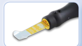
Pinchweld trimming blades