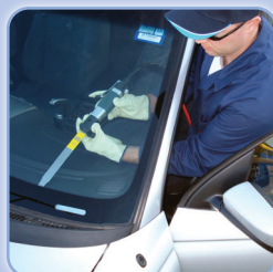
Reach below dashboards

See Page 6 for Auto Glass Removal Applications