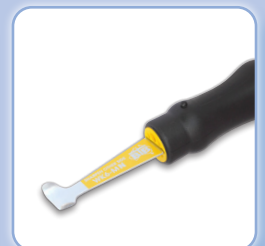
Pinchweld trimming blades