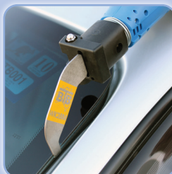
Blades for all applications