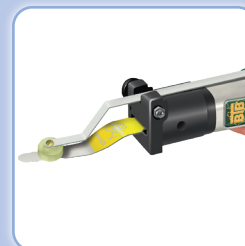
Cutting depth control