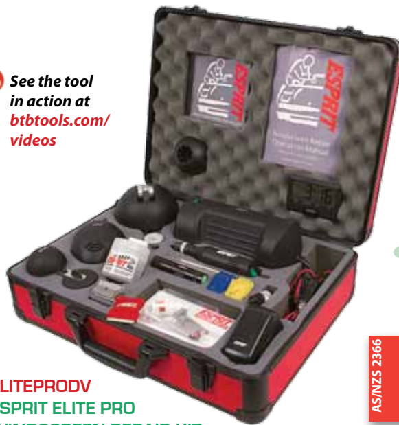
ELITEPRODV ESPRIT ELITE PRO WINDSCREEN REPAIR KIT

BTB See the tool in action at btbtools.com/videos