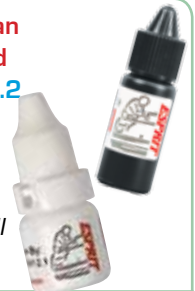
UV CURING RESINS