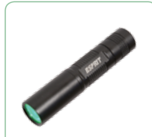
LED INSPECTION TORCH